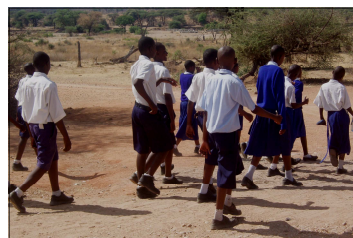
Students on a walking safari

The aim of these Educational Safaris is to give the students and teachers the opportunity to experience wildlife first-hand in order to increase their appreciation of wildlife and for them to better understand the interconnection between wildlife and shared habitats.