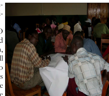
Teachers in group discussions