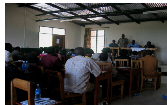
DEO talking to the teachers

tinue teaching their students efficiently and effectively so that the younger generation will have good knowledge and awareness about environmental issues.