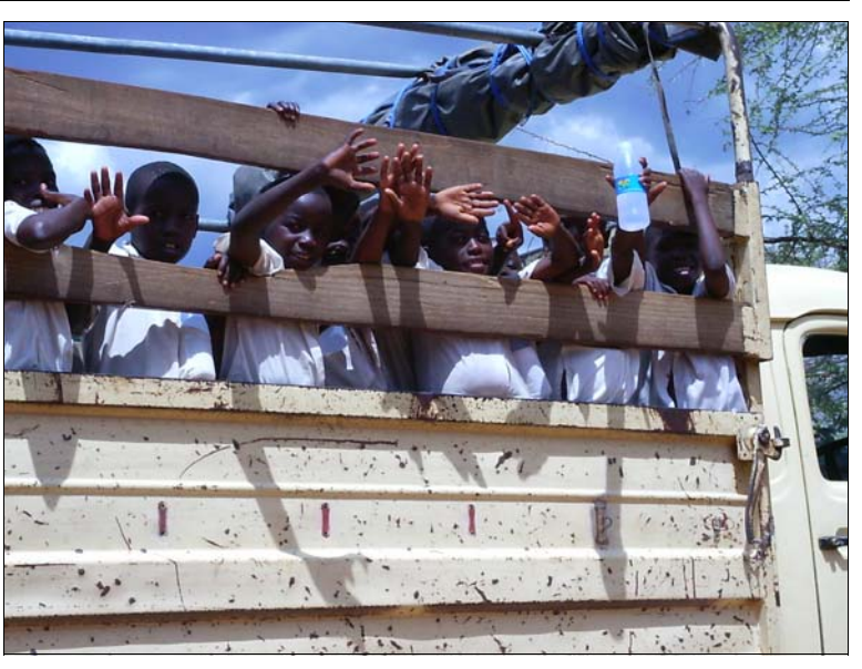
Class two students enjoying their trip to Ruaha National Park. October 2004

October. FORS schedule was made even busier and more taking over 1000 children into Ruaha National Park for a day of wildlife viewing. The logistical challenge of ensuring that a functioning lorry arrived at one of the nine schools every day for three weeks to take up to 50 children to the park was daunting, but FORS overcame all obstacles and the children all had a wonderful day observing animals and other forms of wildlife, many of which they had never seen before. They were shown round by Ruaha National Park guides, who not only