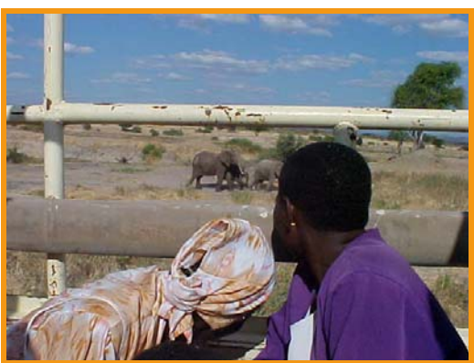
Teachers of Mlowa Primary School enjoy seeing elephants on their game drive.